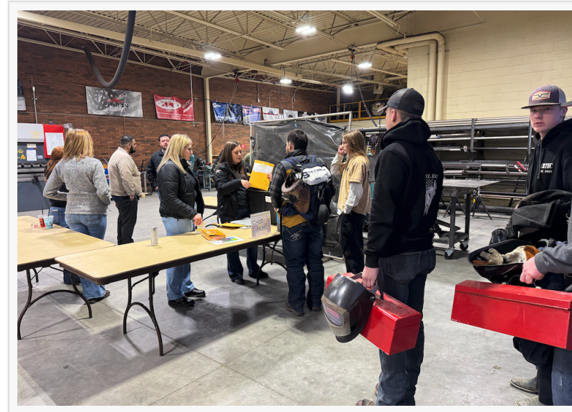
Students checking in to compete at Welding Wars 2025

This year's Welding Wars not only provided a fun and challenging competition for students but also served as a valuable educational experience, fostering connections between aspiring welders, industry experts, and potential employers. It's clear that the event continues to grow in both significance and impact for the local welding community.