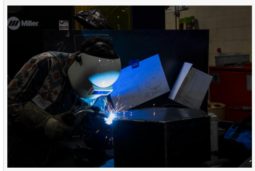
Student Welding in the Welding Wars 2025 competition

Beyond the competition, the event also featured a Career Discovery segment, giving students the chance to connect with 20 industry vendors and manufacturers. This opportunity allowed students to network and explore local job prospects, with many also engaging in mock interviews to sharpen their job-seeking skills.