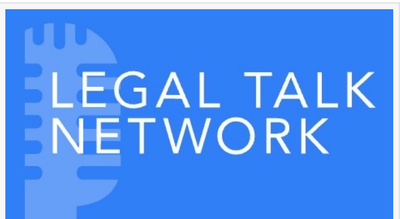
Legal Talk Network