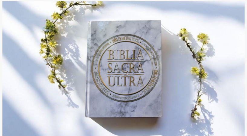
The Biblia Sacra et Ultra includes 300 complete books in the print portion, plus permanent digital access to an expanded and growing library of thousands of additional works

The Biblia Sacra et Ultra isn't just another Bible — it's a seismic leap in the study of religious texts. Anchored by the 66 books of the Holy Bible and translated with the LSV's signature blend of literal accuracy and modern readability, the compilation doesn't stop there. It ventures into uncharted territory, weaving together an astonishing array of additional writings: apocryphal