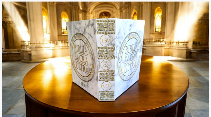
Biblia Sacra et Ultra: The Complete Holy Bible, Apocrypha, and World's Largest Collection of Ancient Judeo-Christian Writings

NEW YORK, NY, UNITED STATES, April 15, 2025 /EINPresswire.com/ -- In a groundbreaking moment for religious scholarship and historical exploration, the freshly-released Biblia Sacra et Ultra (Latin for "The Holy Bible and Beyond") has emerged as the most expansive collection of ancient Judeo-Christian texts ever assembled — many times larger than the Holy Bible. Based on the Literal Standard Version (LSV) Bible project, this extraordinary contemporary-English anthology of literally thousands of ancient works goes far beyond traditional Scripture, offering an unparalleled glimpse into the sacred writings that have shaped Judeo-Christian faith and culture for millennia. Available through various booksellers , it's a treasure trove that is already sparking intrigue among scholars, theologians, and curious readers alike.