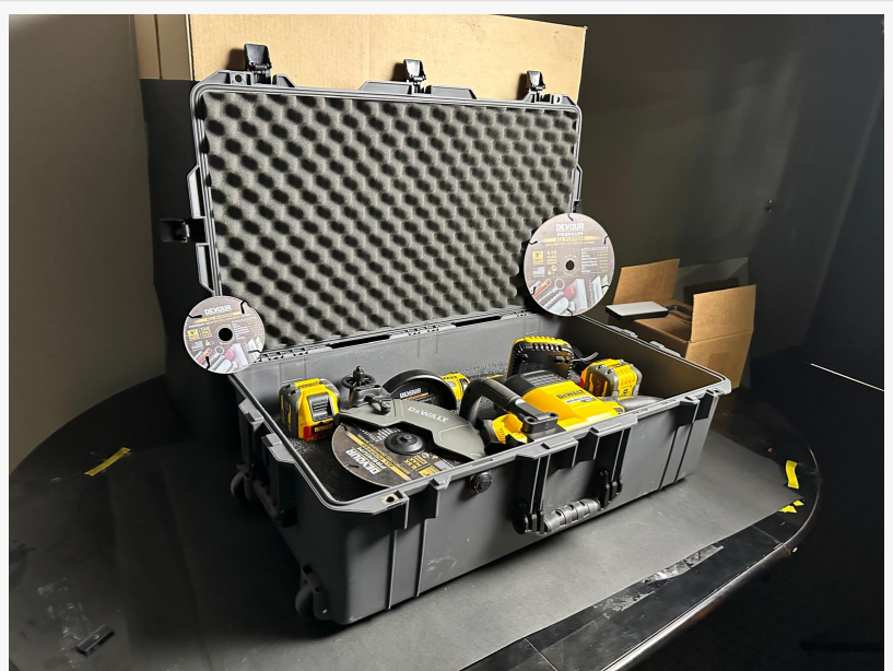
Cut Faster Cut Everything with the Breaching Blade by Devour

For further inquiries or to qualify for a testing blade, contact Ty Whitacre in the marketing department at (260)438-4491. Ensure you're equipped with industry-leading breaching, rescue diamond blades, and Breaching Kits.