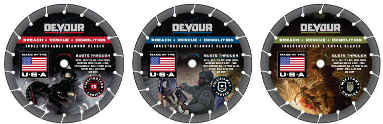
Devour Breaching Blades come in 2 sizes 9 inch and 4.5 inch