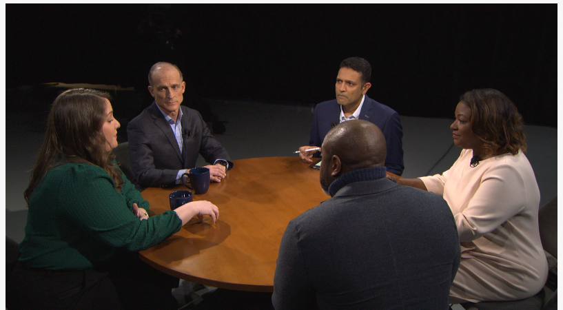
Breaking Barriers: Justice and Work

Second chance hiring isn't charity; it's a smart strategy that strengthens the workforce and the economy. It's not just about inclusion. Untapped talent is our greatest missed opportunity to restore dignity and drive shared success.