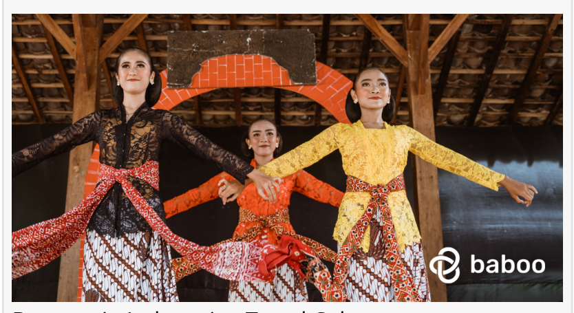
Dancers in Indonesia - Travel Culture

5. Tirana, Albania – One of Europe's most underrated capitals, Tirana is a vibrant city where history meets modern culture. Backpackers can explore communist-era relics, enjoy cheap and