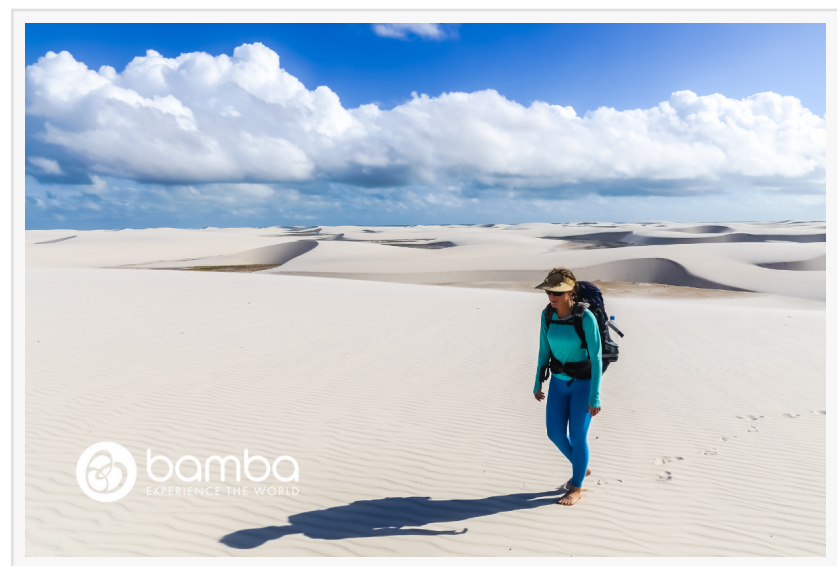
Tourist hiking in Lencois, Brazil