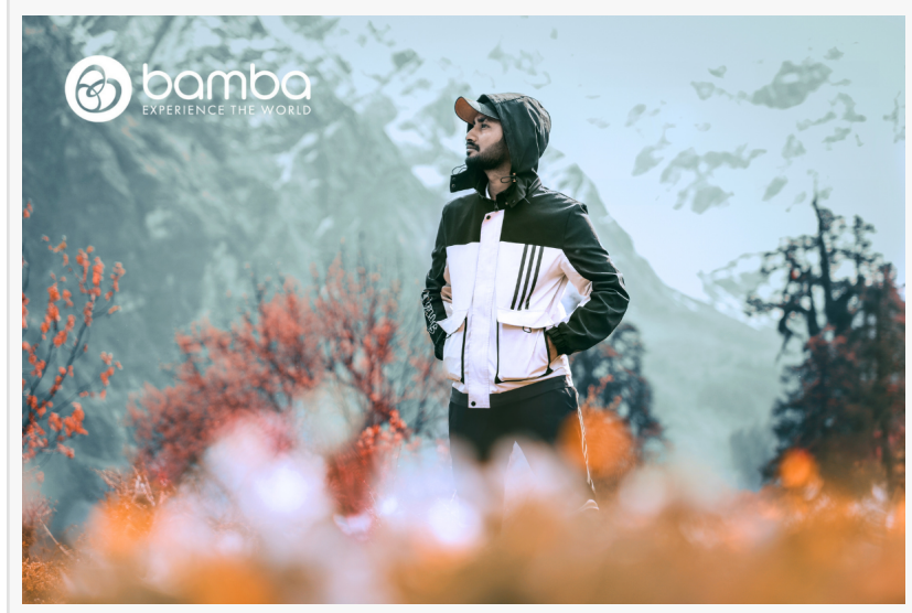
Tourist hiking in Pokhara, Nepal