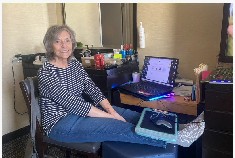
Nye's temporary LAX-North Embassy Suites Hotel home-office

This press release can be viewed online at: https://www.einpresswire.com/article/799156764