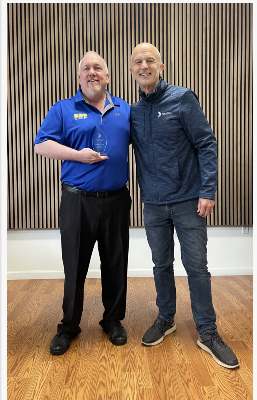
NewBlue celebrates with Code3 AV.