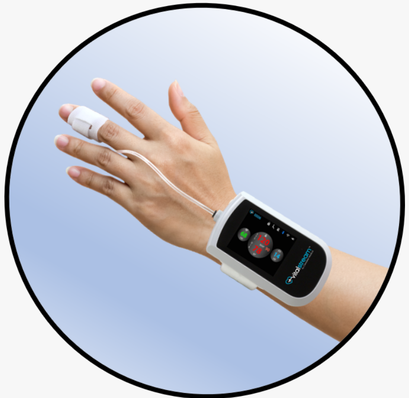
VitalStream is an FDA-cleared wireless, wearable monitor for continuous blood pressure and advanced hemodynamics.