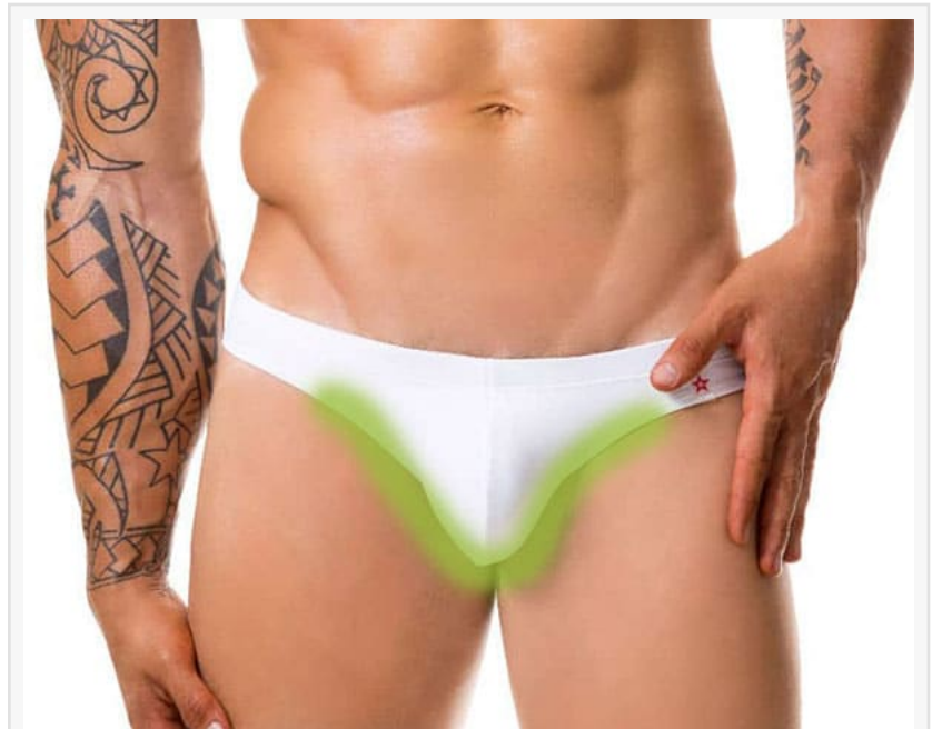
men's private area laser hair removal

At VS MedSpa Laser Clinic, we value client satisfaction and safety through the application of advanced laser technology and quality skincare products. Every treatment program is customised according to personal skin issues and objectives to deliver efficient and lasting