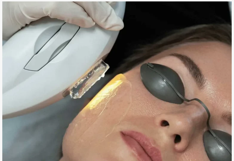
Ipl Skin Treatment