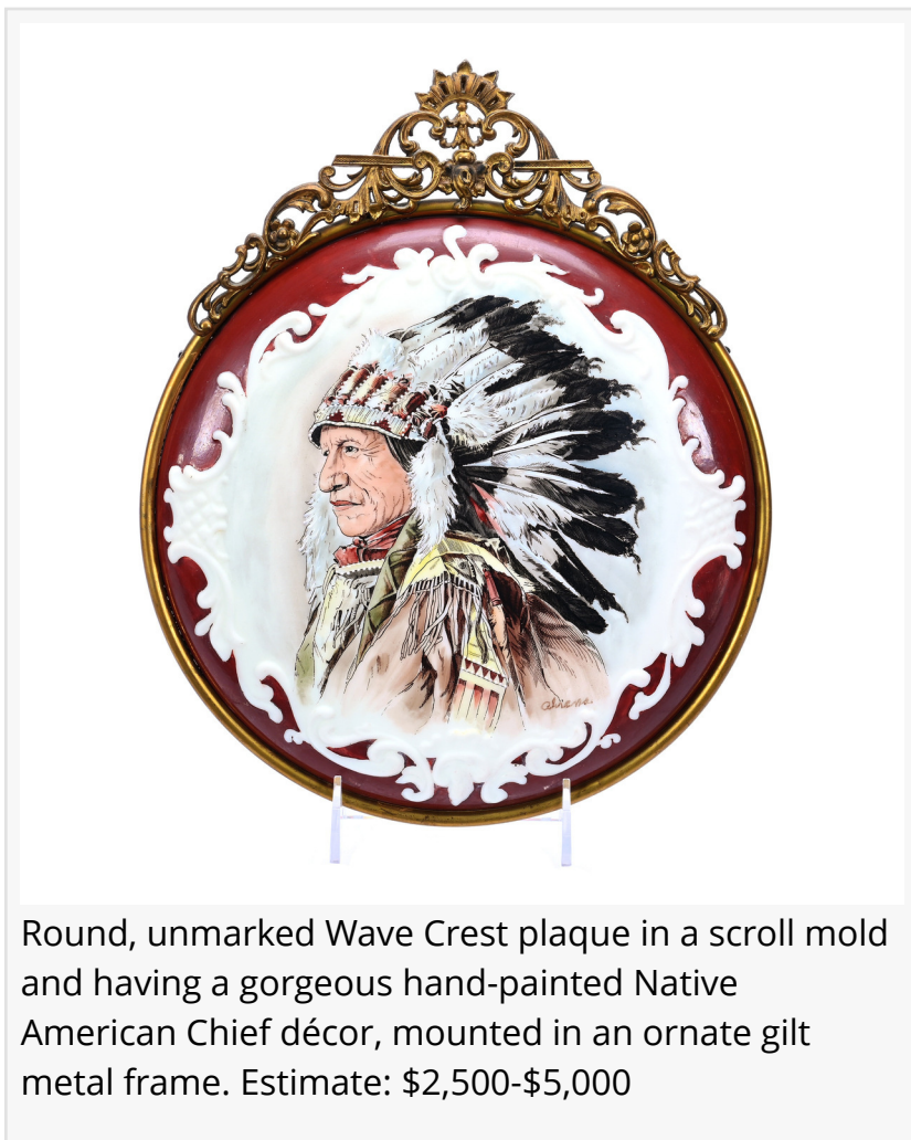
Round, unmarked Wave Crest plaque in a scroll mold and having a gorgeous hand-painted Native American Chief décor, mounted in an ornate gilt metal frame. Estimate: $2,500-$5,000

Lot #36 is a round, unmarked Wave Crest plaque in a scroll mold and having a gorgeous hand-painted Native American Chief décor. The 10-inch plaque, white with a burgundy border, is nicely mounted in a 12 ½ inch by 10 ¼ inch ornate gilt metal frame. Estimate: $2,500-$5,000