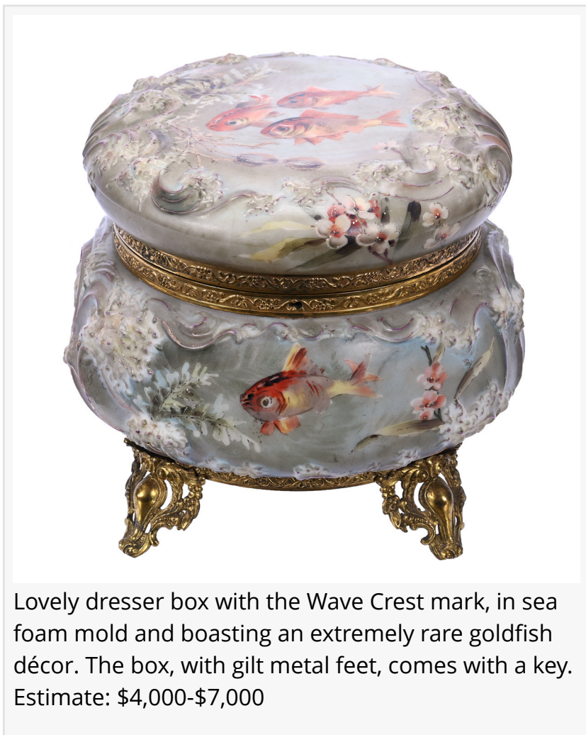
Lovely dresser box with the Wave Crest mark, in sea foam mold and boasting an extremely rare goldfish décor. The box, with gilt metal feet, comes with a key. Estimate: $4,000-$7,000

Bidders should register 48 hours in advance. Absentee bids will require a written statement indicating the amount of the bid. The deadline is noon on Thursday, April 24th. Absentee bids