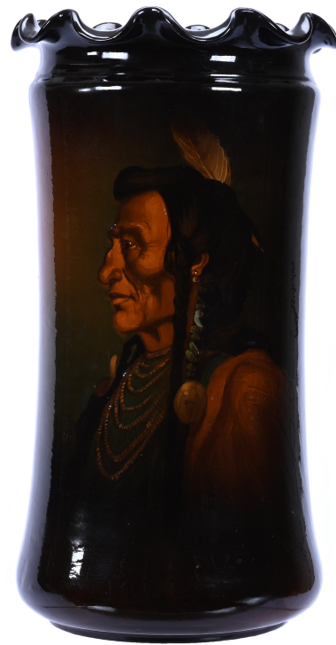
Unmarked Art Pottery umbrella stand with an hand-painted portrait of a Native American brave, 21 \frac{3}{4} inches by 11 \frac{1}{2} inches, attributed to Roseville/Weller. Estimate: $2,000-$4,000

To learn more about Woody Auction and the sale of the Grady and Annette Hite collection on Saturday, April 26th, online and live at the Douglass auction gallery starting at 9:30am Central time (with an automated online-only auction slated for April 25th, starting at 8am Central time), please visit www.woodyauction.com . Updates are posted often.