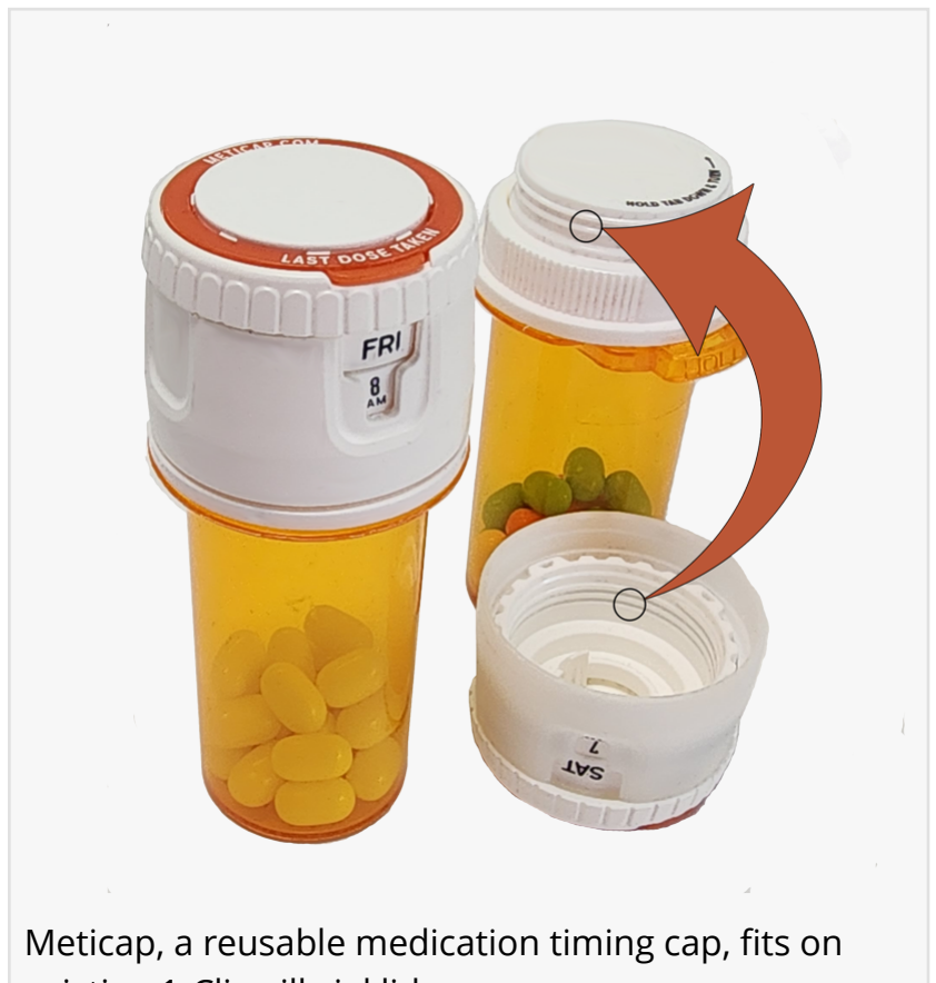
existing 1-Clic pill vial lids.

MEMPHIS, TN, UNITED STATES, April 2, 2025 /EINPresswire.com/ -- Adherence to prescribed medication regimens is a critical component of healthcare, yet it often presents challenges for patients. In recent developments, pharmacists now have access to a revolutionary tool called Meticap, designed to support patients in taking their medications consistently and accurately. Let's explore how Meticap integrates seamlessly into pharmacists' efforts to promote medication adherence and improve customer retention for independent pharmacies.