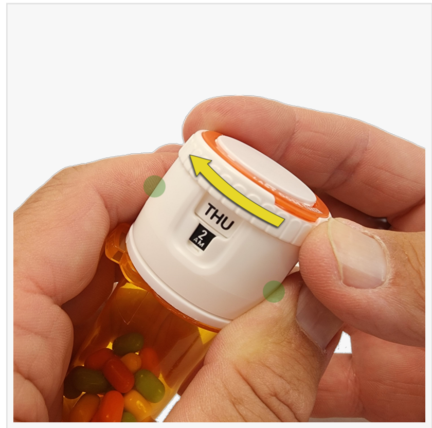
Meticap, a reusable medication timing cap, keeps track of the day with a simple twist to the top of the dial after taking a dose.

Furthermore, pharmacists can leverage their frequent interactions with patients to monitor medication