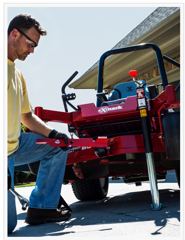
Sharp mower blades help the mower cut grass blades cleanly, improving finished cut quality and turf health.

Exmark Manufacturing was incorporated in May 1982 as an independent manufacturer of professional turf care equipment. Today, it is the leading manufacturer of commercial mowers and