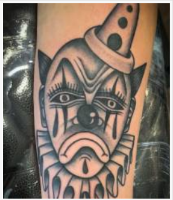
Tattoo Artwork from Luckys Tattoo Parlor #2

When it came time to select this year's recipient, Luckys Tattoo Parlor stood out as a reputable company in the tattoo industry. Known for its skilled, creative, and friendly team, Luckys Tattoo Parlor has earned a strong