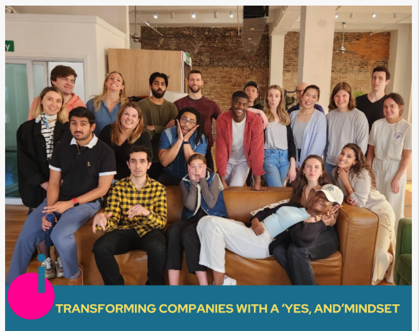
Corporate Improv Training Session