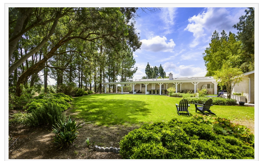
The Meadowglade provides a peaceful escape for mental health treatment.

MOORPARK, CA, UNITED STATES, April 3, 2025 /EINPresswire.com/ -- The Meadowglade, a leading evidence-based mental health treatment provider, is proud to announce its innetwork agreement with Blue Shield of California. This exciting collaboration enables Blue Shield of California members to now have access to The Meadowglade's Residential, Partial Hospitalization Program (PHP), and Intensive Outpatient Program (IOP)