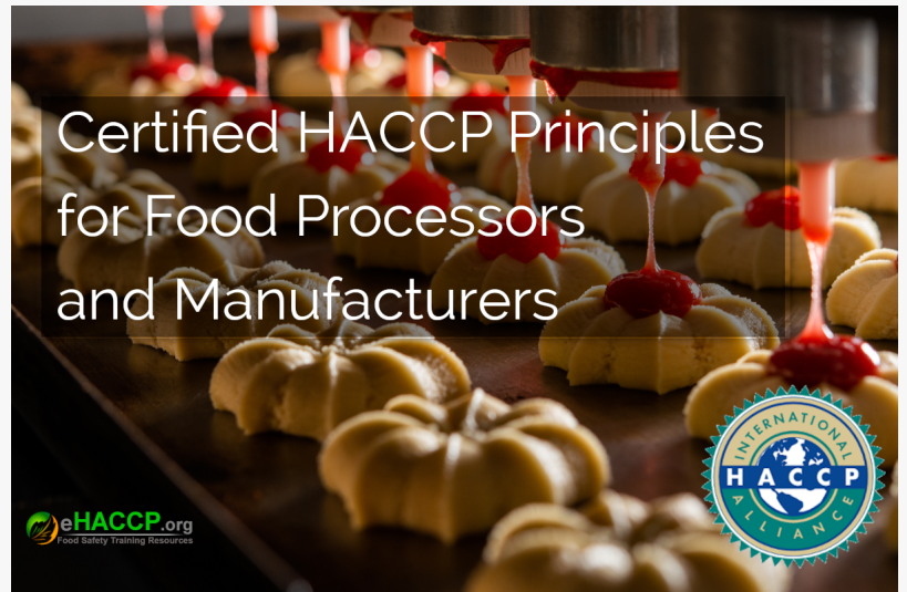
HACCP course name: Certified HACCP Principles for Food Processors and Manufacturers