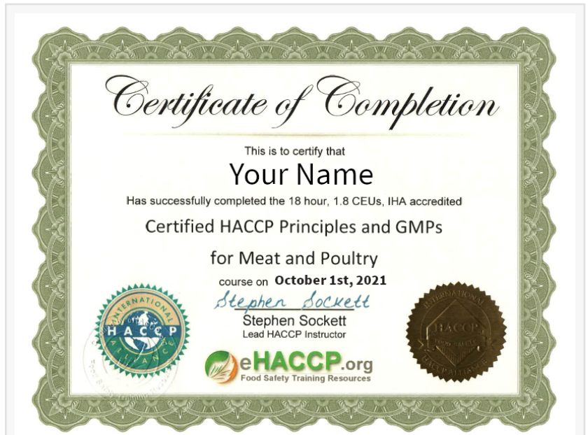
HACCP certificate of completion

Affordability is another recurring theme, with courses priced competitively (e.g., $199 for many