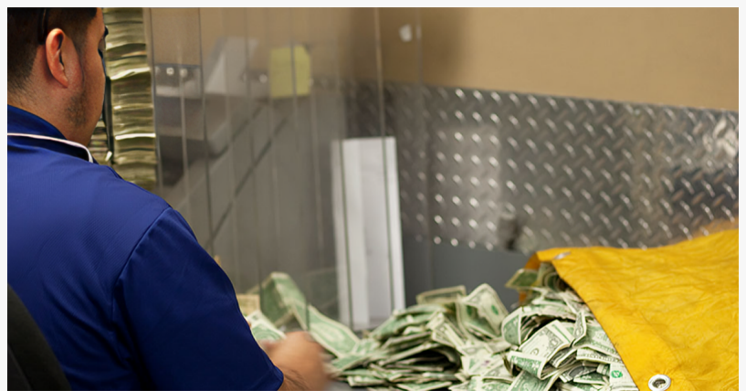
Cash delivery solutions

Their armored trucks have advanced security systems. This includes reinforced doors, GPS tracking, and monitored routes. These features help reduce risks during transport.