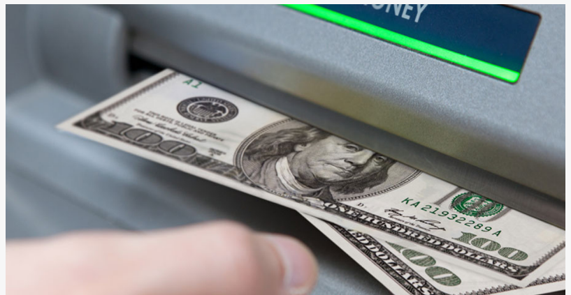
Cash handling solutions--