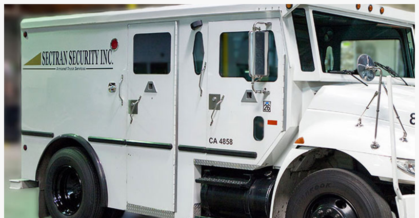
Secure storage solutions