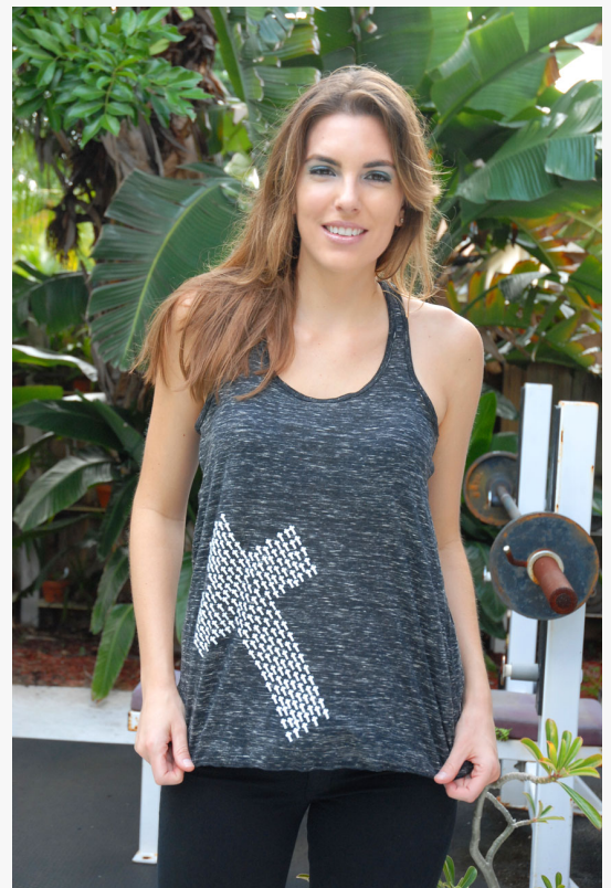
Woman wearing top with cross sign - ... ritualSurfWear