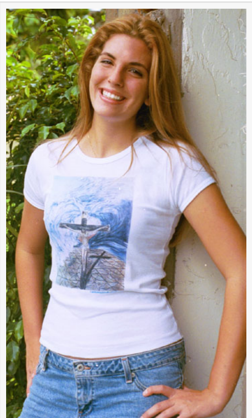
Woman wearing tshirt with Jesus in ... irtualSurfWear.

This press release can be viewed online at: https://www.einpresswire.com/article/799775095