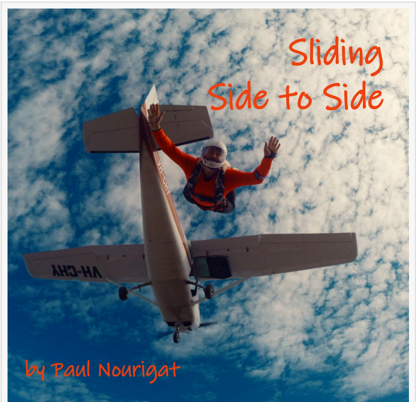
Cover art for Sliding Side To Side, lead single by Paul Nourigat

The 66 year old singer-songwriter came to music late in life, during Covid, with Curious