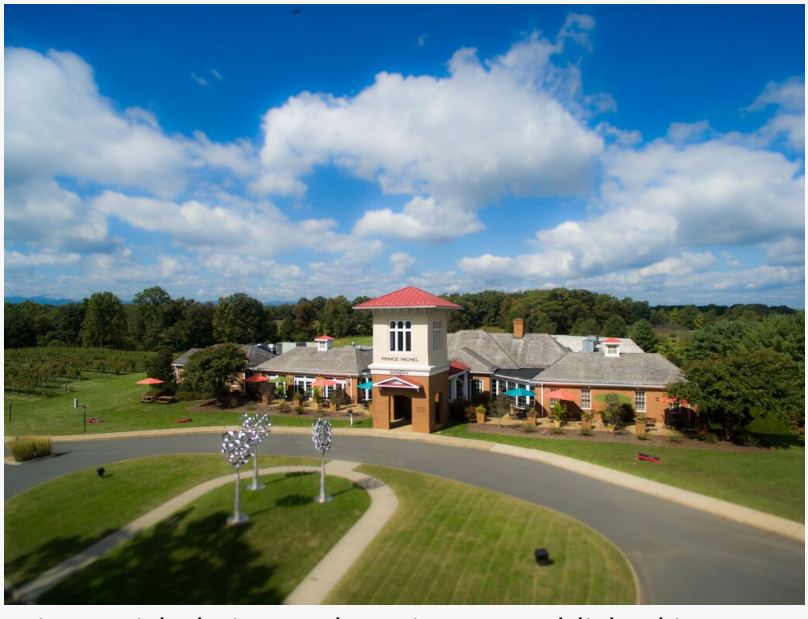
Prince Michel Vineyard & Winery Established in 1982