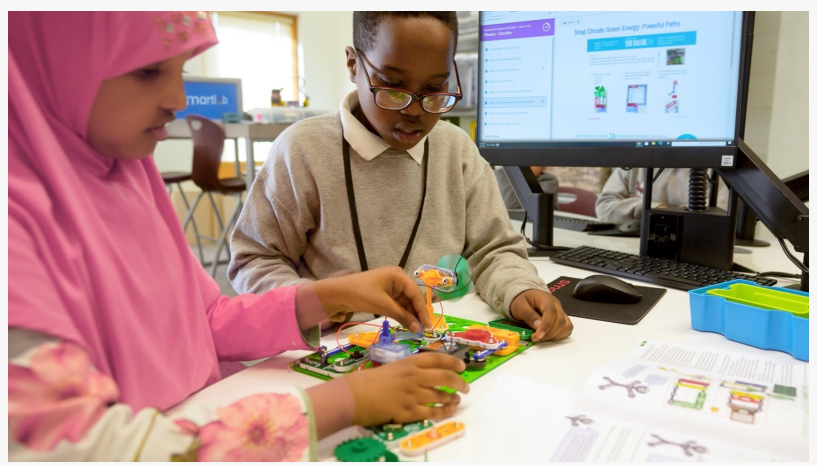
Maplewood Elementary SmartLab Students