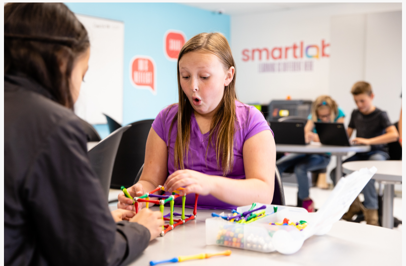
Engaged Students in a SmartLab