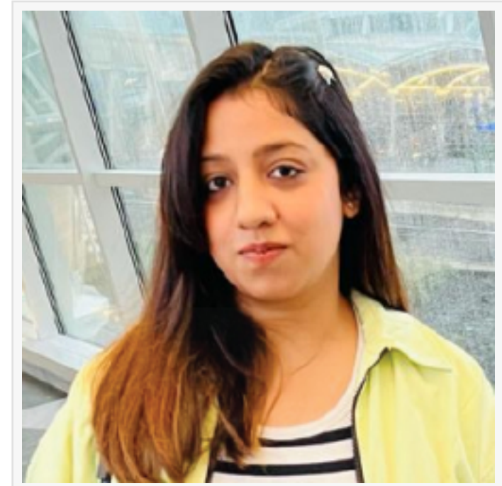
IndianEggDonor.com - ED07173 Beautiful & Brilliant Egg Donor Available

IndianEggDonors.com is recognized as one of