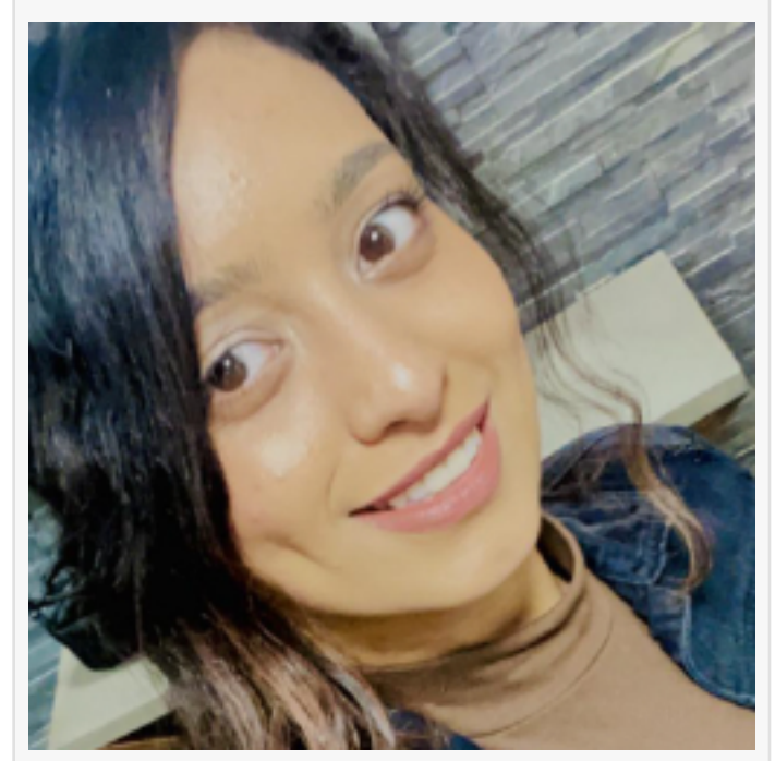
IndianEggDonors.com - ED01505 Beautiful & Brilliant Egg Donor Available

dreams of parenthood. We take pride in our high egg donor success rates, offering families a reliable, secure, and efficient process. Many of our recipients have shared stories of successful pregnancies, with testimonials highlighting our trusted egg donation services.