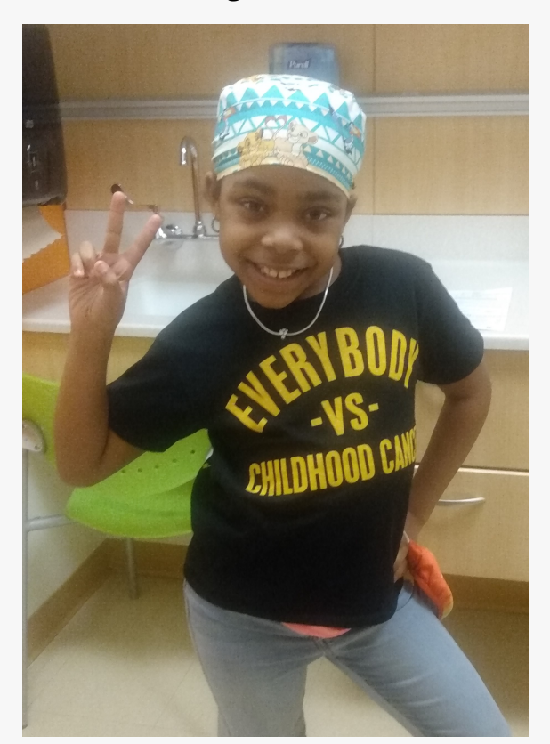
New Day Foundation helps families fighting cancer by paying critical living expenses during treatment.

professional counseling network to give hope to those coping with the fear, anxiety, and toxic side effects of cancer treatment."