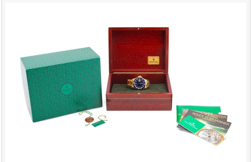
Rolex Oyster Perpetual Submariner date wristwatch in 18k yellow gold with a blue dial, white markers, date window, synthetic sapphire crystal and oyster bracelet. Estimate: $26,000-$29,000