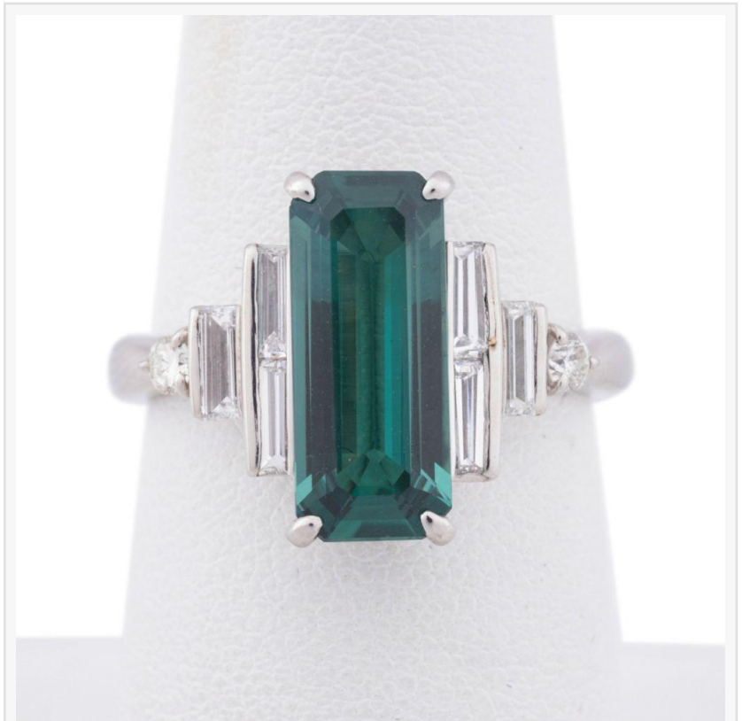
Art Deco style Indian alexandrite and diamond ring in platinum, with a rectangular step cut green alexandrite weighing 2.83 carats and round and baguette diamonds. Estimate: $8,500-$9,500

This press release can be viewed online at: https://www.einpresswire.com/article/799840868