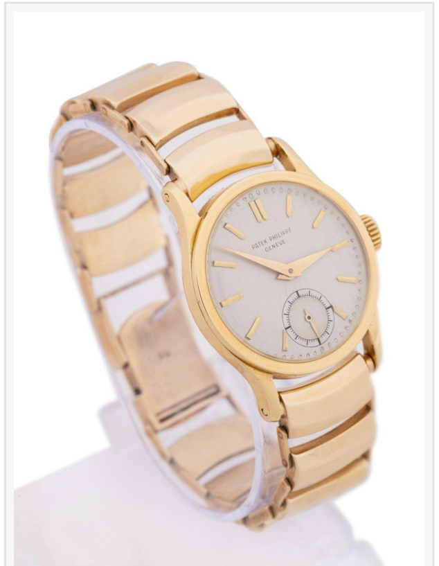
Patek Philippe Calatrava 18k gold men's watch with a manual movement, silvered dial with gold markers and seconds dial, and 14k yellow gold link bracelet. Estimate: $10,000-$14,000

A Tiffany & Co. "Atlas" toggle chain link necklace in 18k yellow gold and showing the maker's mark, "2003", "750" and "Italy" to the side of the pendant, is expected to command $6,000-$9,000. The necklace is 1.7 inches long and 0.875 inches in diameter, with a total weight of 82.1