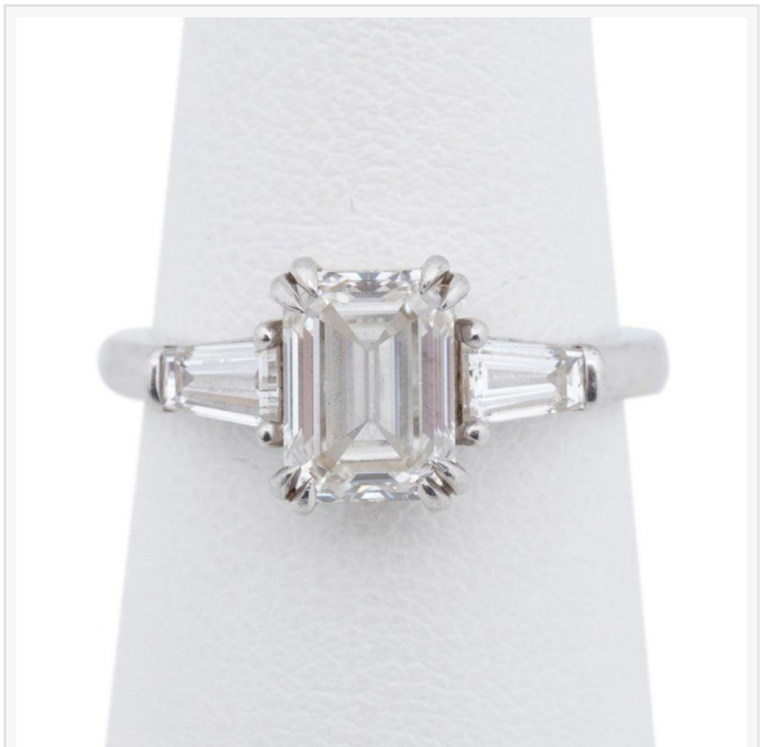
Diamond engagement ring in platinum, with an emerald cut diamond weighing 1.70 carats (VVS-1 clarity and G color), and two tapered baguette shape diamonds. Estimate: $8,000-$12,000

Jamia Berry Ahlers & Ogletree, Inc. +1 404-869-2478 email us here