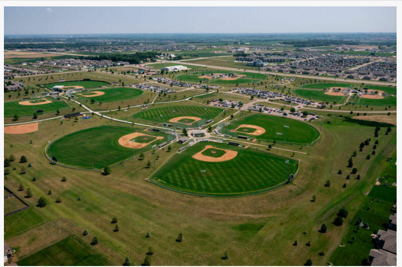
City of Sioux Falls completed upgrades to baseball fields 1-3 last Fall