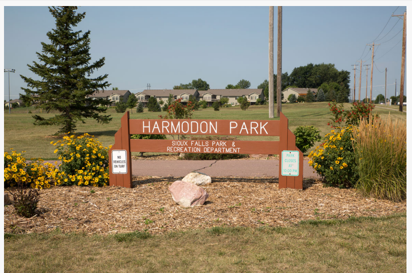
Harmodon Park features 7 Baseball and 8 softball fields

SIoux FALLS, SD, UNITED STATES, April 3, 2025 /EINPresswire.com/ -- The Sioux Empire Baseball Association (SEBA) and Sioux Falls Slow Pitch organizations are pleased to announce a new partnership with SportsMan Solutions, one of the nation's leading sponsorship activation firms. This collaboration aims to enhance sponsorship offerings at Harmodon Park, a key sports & recreation complex in Sioux Falls.