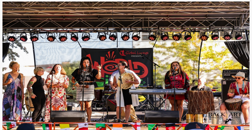
Beats & Bones at the 2024 World Village

This press release can be viewed online at: https://www.einpresswire.com/article/800022696