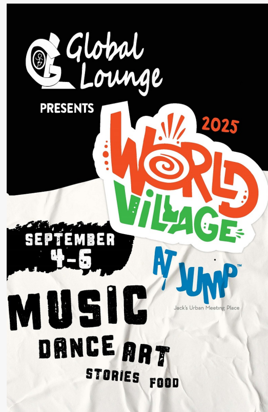
World Village 2025