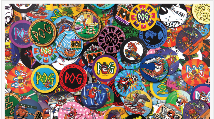
90s Peak Childhood

LOS ANGELES, CA, UNITED STATES, April 4, 2025 /EINPresswire.com/ -- POG, the iconic '90s collectibles company, is reinventing collectible culture for a new generation—announcing today three landmark initiatives designed to bridge the gap between physical nostalgia and digital innovation: