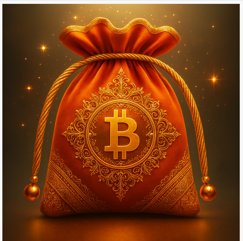
Digital Gold in POG Form