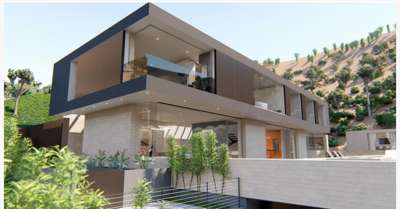
Custom home Design