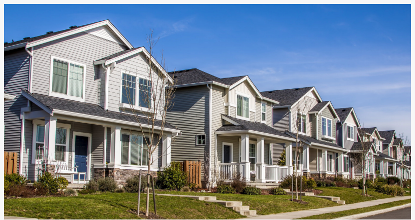
Affordable Townhomes Design

In addition to townhome design, 121 Design Build Inc. provides architectural services for custom home projects. The firm assists property owners in developing new residences by creating designs that reflect site-specific conditions and construction requirements. These projects involve the planning and layout of residential structures while ensuring compliance with safety