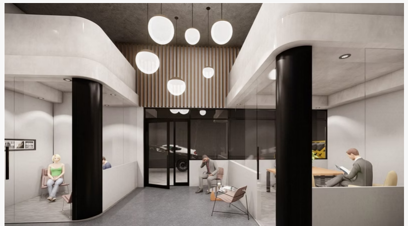
Contemporary Home Design