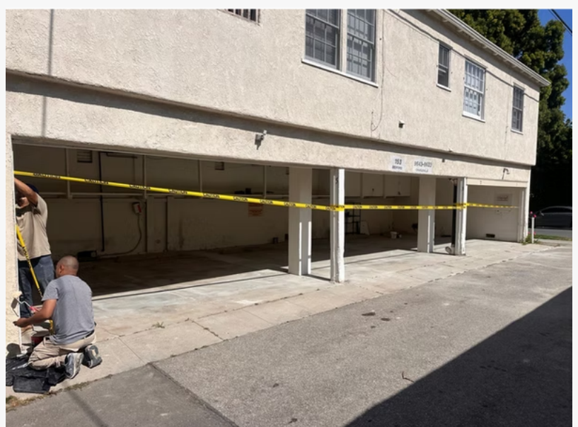
Home Designers and Builders

Navigating building permits and zoning approvals is an essential part of any construction or