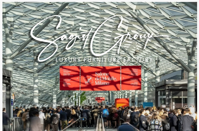
Sagist Group Triumphs at Milan Design Week 2025 with Prestigious Award

/EINPresswire.com/ -- Milan Design Week 2025 , one of the world's premier design events, concluded with an unforgettable celebration of creativity and innovation. Held from April 6th to 13th, the week showcased cutting-edge designs under the theme "Connected Worlds," emphasizing the integration of physical and digital dimensions in design. With iconic exhibitions such as Salone del Mobile and Fuorisalone, the event attracted designers, architects, and industry leaders from around the globe.