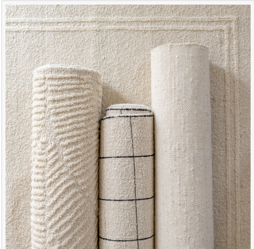
New Rugs Collection