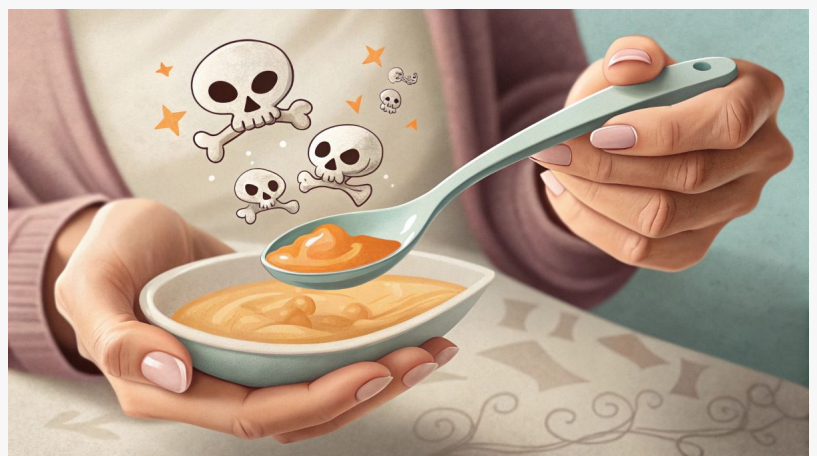
Closeup of baby food with toxic skulls floating in the air