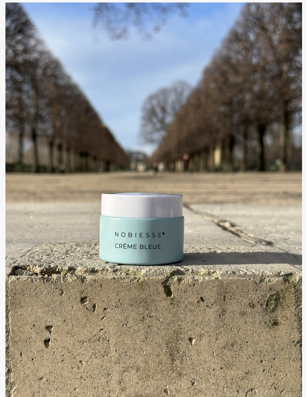
Nobiesse Crème Bleue with Methylene Blue

Crème Visage is a cornerstone of the Nobiesse Face & Eye collection, a curated lineup focused on targeted support for delicate facial skin and the periorbital area. The product was developed with the aim of offering daily cellular support, especially for individuals seeking to avoid conventional skincare products that may contain endocrine-disrupting ingredients or irritants.