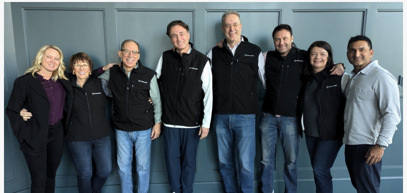
The LOUD Collective Leadership Team

Welcome to the launch of LOUD Collective