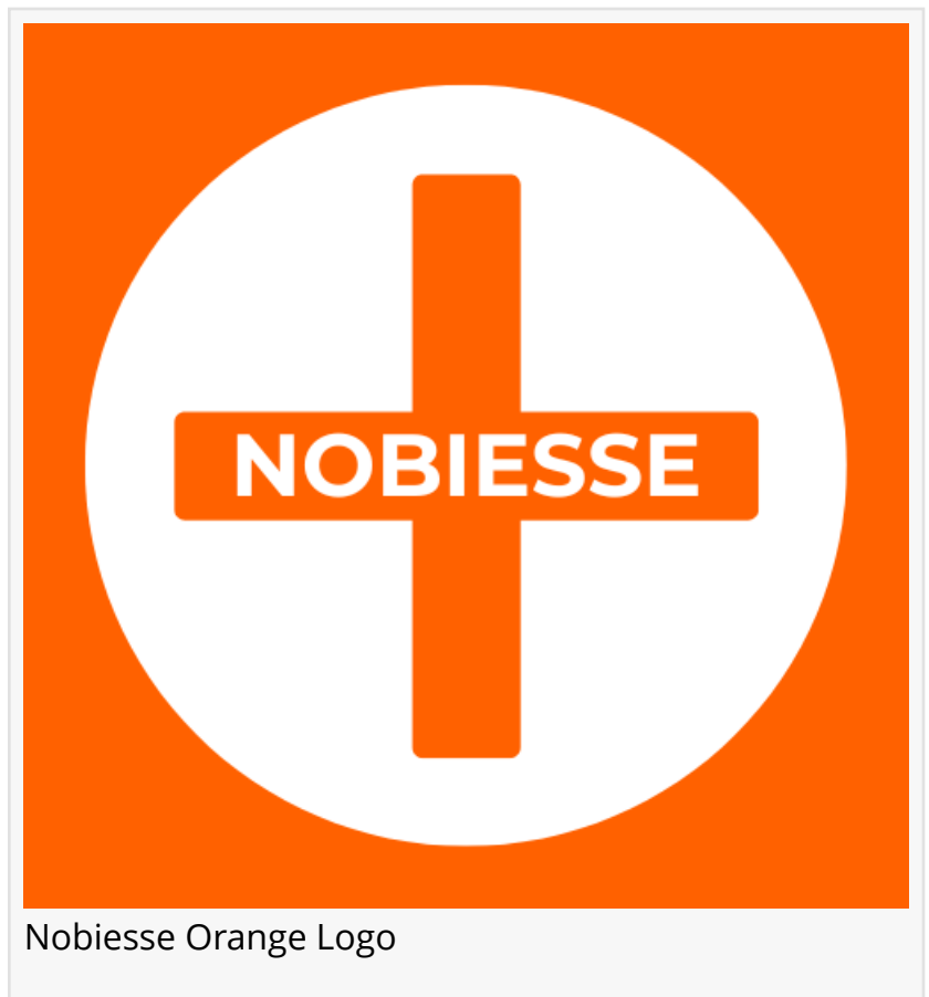
Nobiesse Orange Logo

While many solid shampoo options exist, Nobiesse sets itself apart with its meticulous ingredient selection, formulation expertise, and commitment to luxury wellness. The brand prioritizes purity, effectiveness, and sustainability, ensuring that every product meets the highest standards of clean beauty.