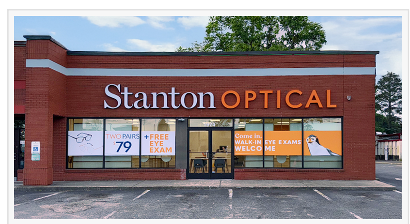
Stanton Optical Florence - Your Ultimate Destination for Glasses, Contacts, and Sunglasses

FLORENCE, SC, UNITED STATES, April 25, 2025 /EINPresswire.com/ -- Stanton Optical, a pioneer in accessible and affordable eye care, proudly announces the grand opening of its first location in Florence, SC on March 10th. Located at 1974 W Palmetto St., Florence, SC 29501, this new store further reinforces Stanton Optical's mission of "Making Eye Care Easy" with