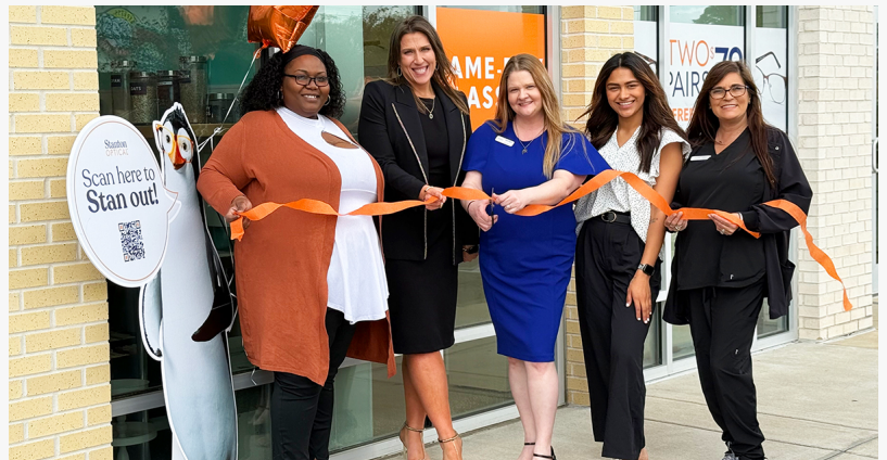
Stanton Optical Goldsboro Staff Celebrating Grand Opening with Ribbon-Cutting Ceremony

Stanton Optical: We Make Eye Care Easy, Accessible, and Affordable for All