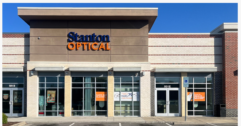
Stanton Optical Goldsboro - Your Ultimate Destination for Glasses, Contacts, and Sunglasses

GOLDSBORO, NC, UNITED STATES, April 11, 2025 /EINPresswire.com/ -- Stanton Optical, a leader in affordable and accessible eye care, is thrilled to announce the grand opening of its latest store at 501 North Berkeley Boulevard, Suite E, Goldsboro, NC 27534. This marks Stanton Optical's continued commitment to its mission of "Making Eye Care Easy" while expanding its footprint to over 290 locations across the nation. □