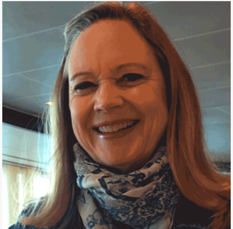
Caring Critters and The Alphabet They Share: A Book About Love, Kindness, and Empathy

Caring Critters is a loving and impactful resource for helping children grow into thoughtful, confident, and compassionate individuals, and it is perfect for reading aloud at home, in the classroom, or during storytime.