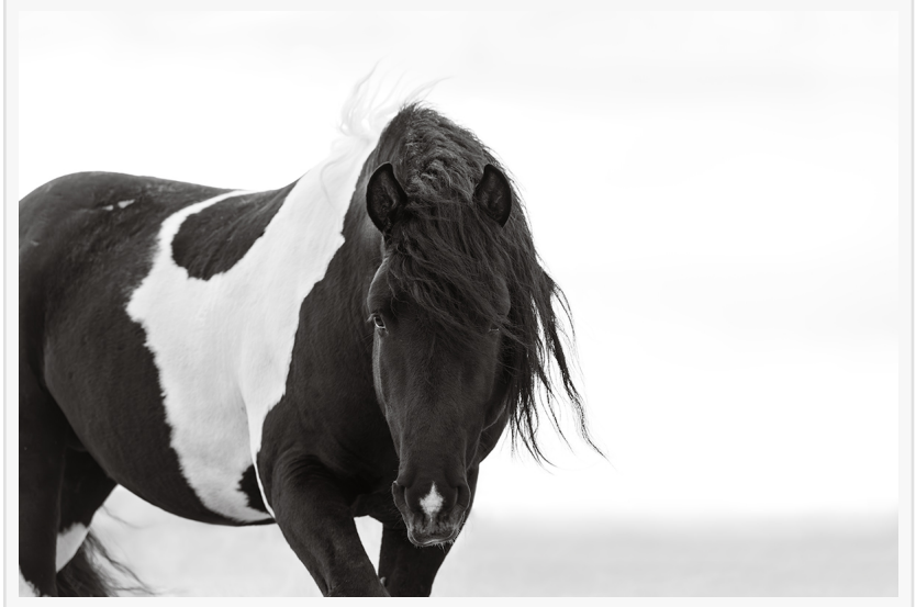
Regal

Her hope is that as her work becomes more visible, the difficult situation facing the wild horses is what becomes prominent in her viewer's minds, saying: "Without awareness, better solutions are not developed. And without better solutions, this issue cannot be solved. I'm hoping to be a small part of bringing awareness to this bigger issue."