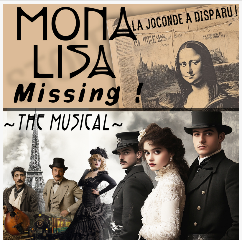
Singing, Dancing, Mystery, Intrigue...