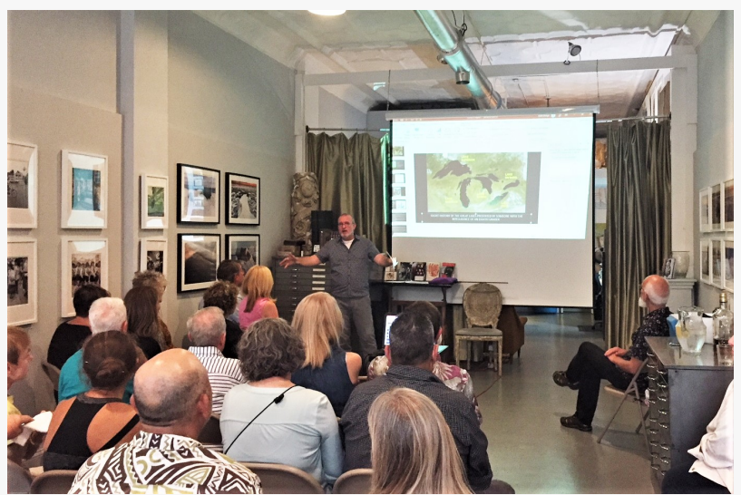
Rare Nest hosts receptions, lectures, book-parties and artist's talks