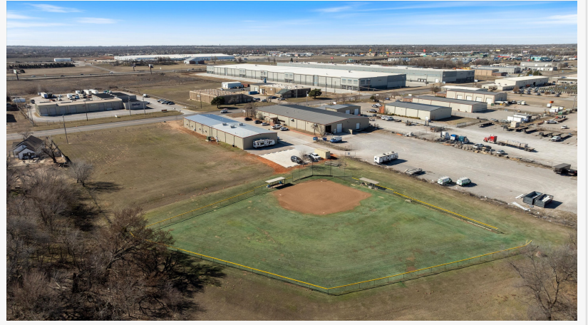
Aerial Shot of Baseball Diamond and 5.46 Acre parcel