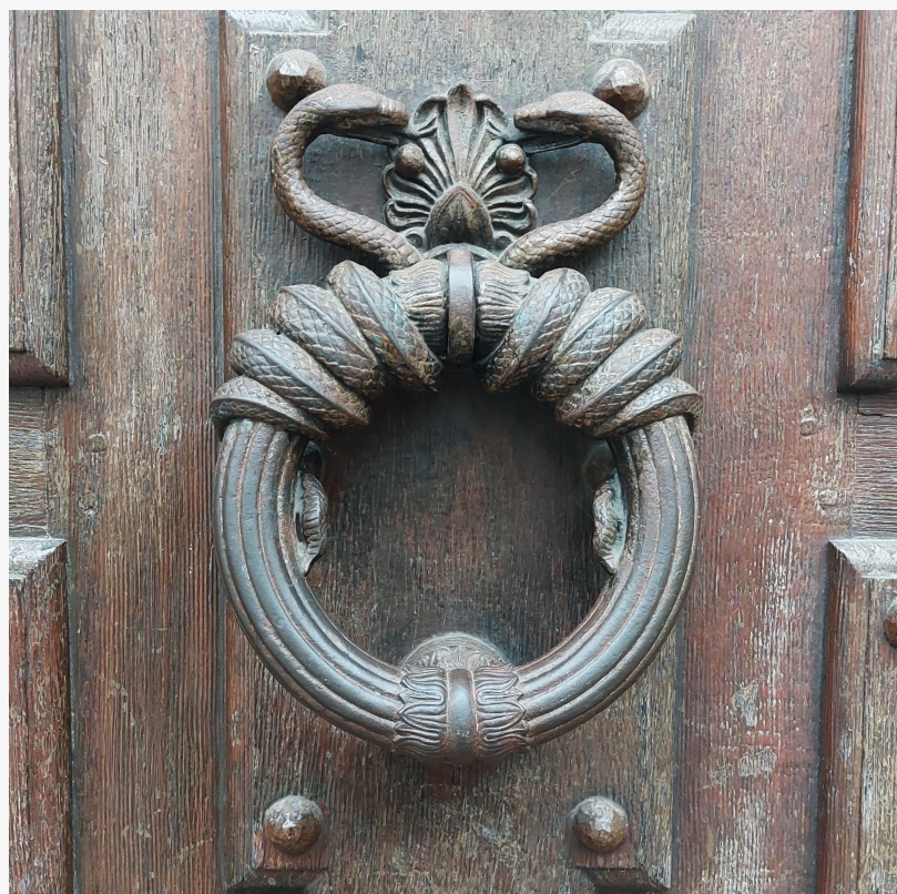
Snake Knocker Hôtel de Béthune-Sully / Centre des Monuments Nationaux c. 1630

This press release can be viewed online at: https://www.einpresswire.com/article/800709796