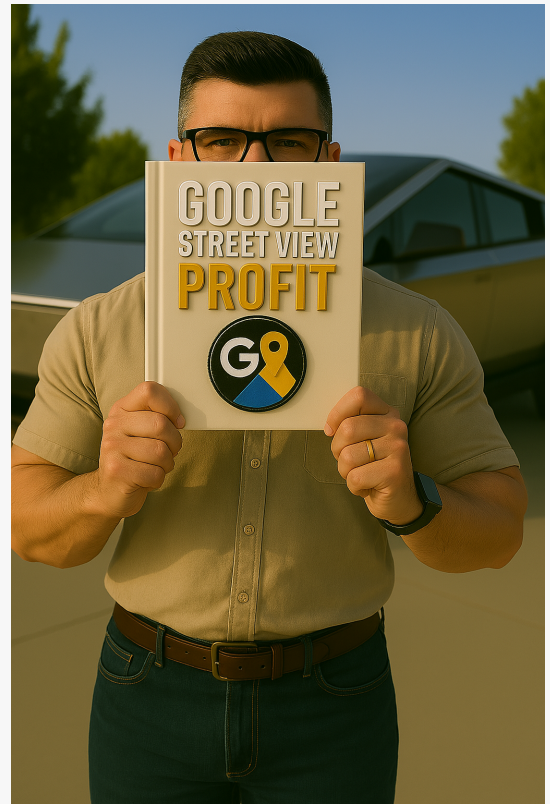
google street view profit book