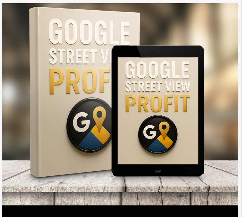
google street view profit book

— Zach Calhoon, Author of Google Street View Profit