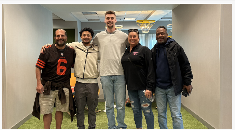
TravelingWiki Meets with Impact Charity Skyy2Win at NCAA Final Four to Support Special Needs Resources