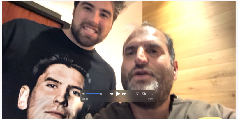
TravelingWiki Meets with Duke University Basketball at Final Four to Promote Special Needs Awareness

SAN ANTONIO, TX, UNITED STATES, April 7, 2025 /EINPresswire.com/ -- During the days surrounding the NCAA Final Four, TravelingWiki had an extensive set of engagements surrounding the Final Four NCAA Tournament to promote special needs awareness, including: