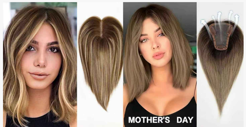
wig hair piece