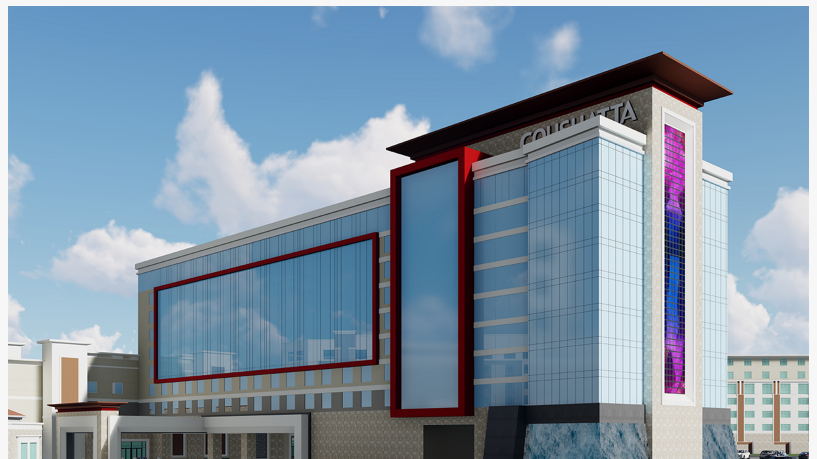
Rendering of newest hotel at Coushatta Casino Resort

everyone involved. Ultimately, this expansion means more jobs for our people, more reasons for