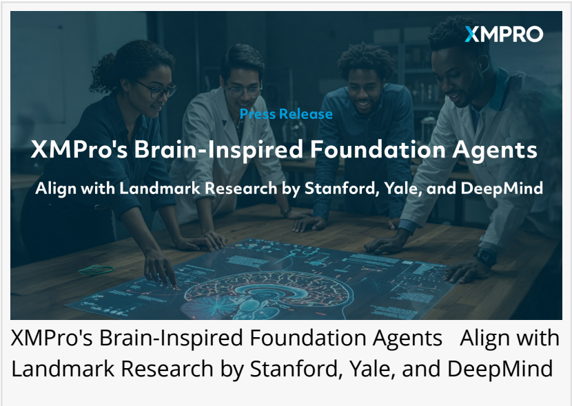
XMPro's Brain-Inspired Foundation Agents Align with Landmark Research by Stanford, Yale, and DeepMind

DALLAS, TX, UNITED STATES, April 7, 2025 /EINPresswire.com/ -- XMPro, a leader in industrial AI solutions, today announced that its Multi-Agent Generative Systems (MAGS) approach shows strong alignment with principles outlined in a landmark research paper published by scientists from 20 top institutions including Stanford, Yale, Microsoft Research, Google DeepMind, Duke University, and CIFAR.