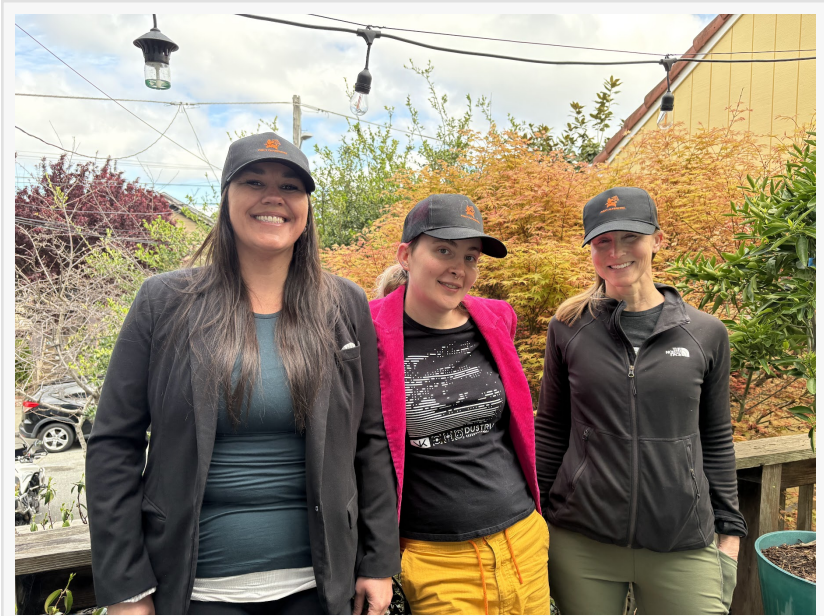
The SF Team

SAN FRANCISCO, CA, UNITED STATES, April 17, 2025 /EINPresswire.com/ -- Building on the success of Fight Health Insurance , we're proud to announce the beta launch of Fight Paperwork , a specialized agentic platform designed to empower healthcare professionals in the unique battle against claim denials. Say goodbye to the frustrating and time-consuming process of generating appeals – and huzzah to our helpful AI tool.