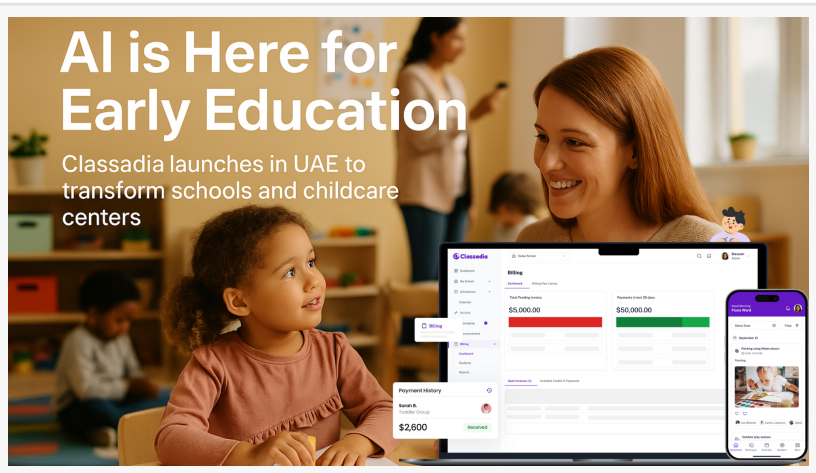
Classadia Introduces AI in Early Education & Childcare Management

DUBAI, DUBAI, UNITED ARAB EMIRATES, April 8, 2025 /EINPresswire.com/ -- Classadia, an innovative Al-driven childcare and school management platform, has officially launched in the UAE, bringing cutting-edge technology to the early education sector. Designed to streamline operations, enhance